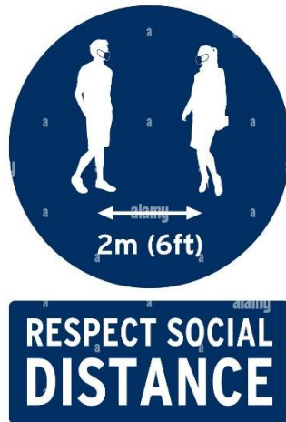
Illustration 3 (O.M.S, p. 2021)