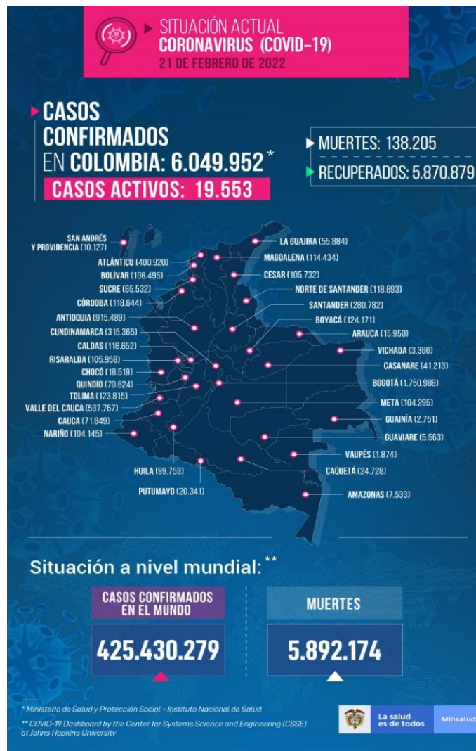
Illustration 1 (Ministry of Health, Col. 2010)

In the bulletin generated on February 18, 2022, a total of 19,553 active cases were evidenced with 138,205 deaths and 6,049,952 recovered in Colombia, according to the Ministry of Health and Social Protection. (Ministry of Health, 2022)