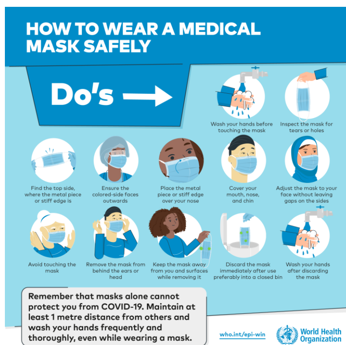
Illustration 4 (World Health Organization , 2020)