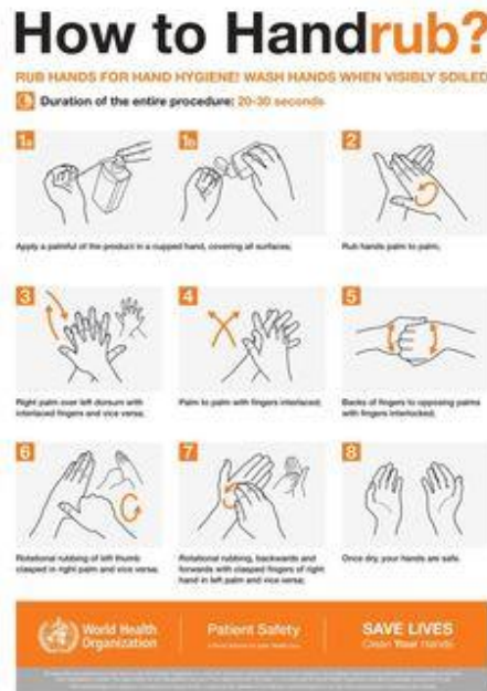
Illustration 2 (O.M.S., 2010)

C. Have and use alcohol minimum 60% maximum 95% to guarantee its effectiveness.